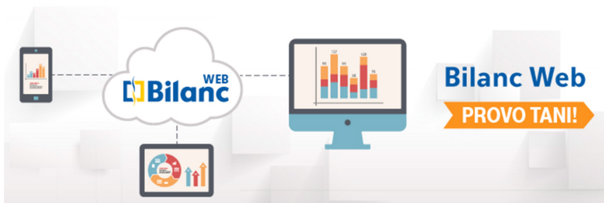
Figure 3. Bilanc Web schematic view

Another software provider in the field of accounting and financial management is Bilanci sh.p.k., that offers the packages Bilanc Online and Bilanc Web. Bilanc Online, just like its competitor Alpha Web is based on cloud technology and offers all the functionality of a desktop application, plus access to the data via the web interface. Unlike Alpha Web whose functionality is based on desktop version Alpha Start (the most basic desktop version developed by IMB), Bilanc Online seems to enjoy the status of the most advanced desktop version (Bilanc Profesional) produced by Bilanc sh.p.k., plus provides real-time data access via the Internet. Bilanc Web is the latest product offered by the same provider where users can log on to their company’s account via an Internet browser. It does not require any installation; it can operate in many devices simultaneously and it features automatic back up and maintenance of the technical infrastructure.