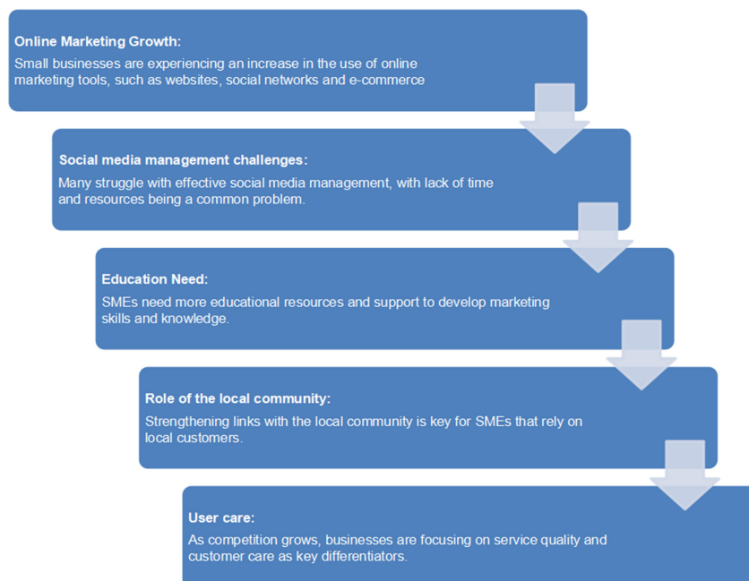
Figure 3. Sustainable development of marketing in SMEs in Bulgaria and the EU