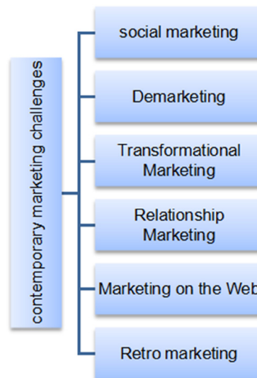
Figure 1. Identifying the modern challenges of marketing